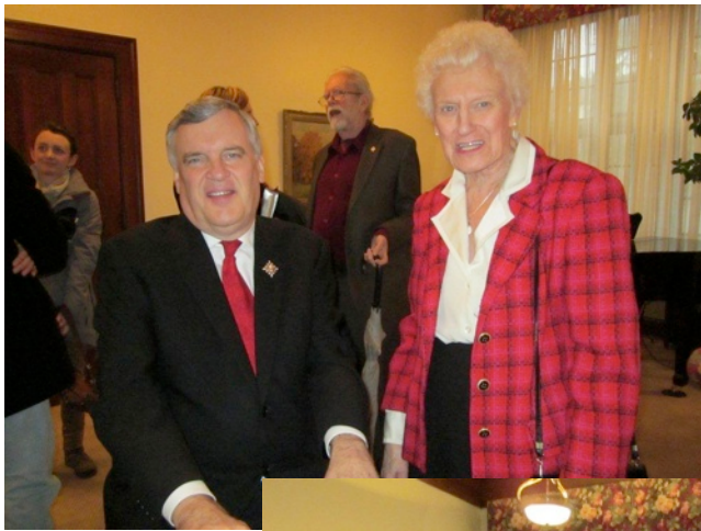
Ontario's Lieutenant Governor, David Onley, visits YPBC