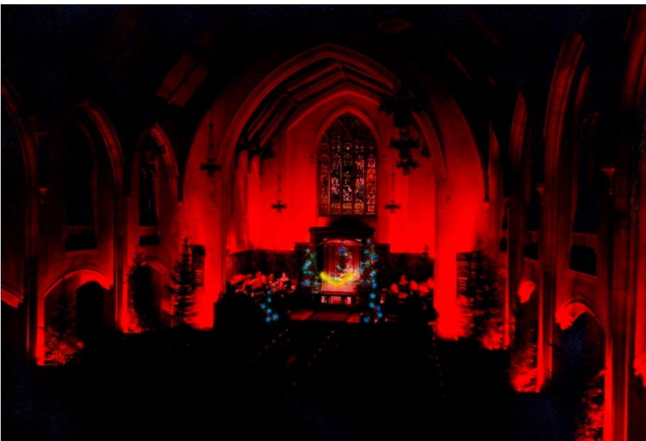
Yuletide Carol Festival Park Road Baptist Church c 1938