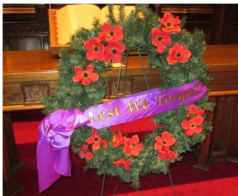
Remembrance Day Sunday